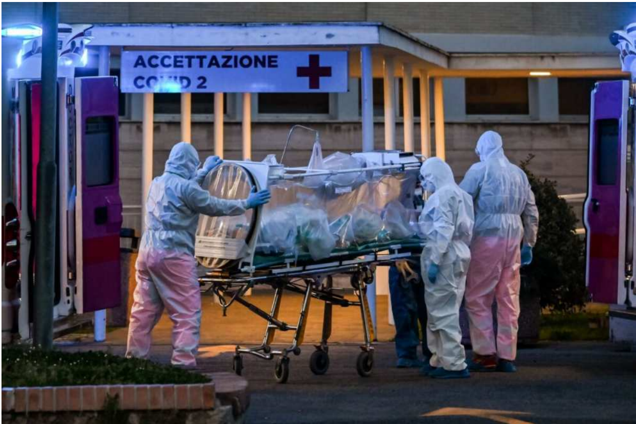
Medical workers in overalls stretch a patient under intensive care into the newly built Columbus Covid 2 temporary hospital at the Gemelli hospital in Rome on March 16, 2020.

Meanwhile, the measures taken to quarantine and treat the population of Wuhan were grotesquely inhumane. Apartment buildings were welded shut. Temporary “hospitals” were created that actually served as jails for those believed to be sick with the virus. Locked into these places with no medical treatment and little food, the unfortunates were trapped there until death.