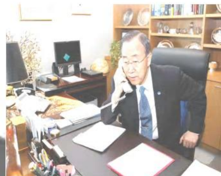
MR. BAN KI-MOON U/N SECRETARY