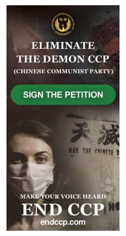
Click here to Sign the Petition