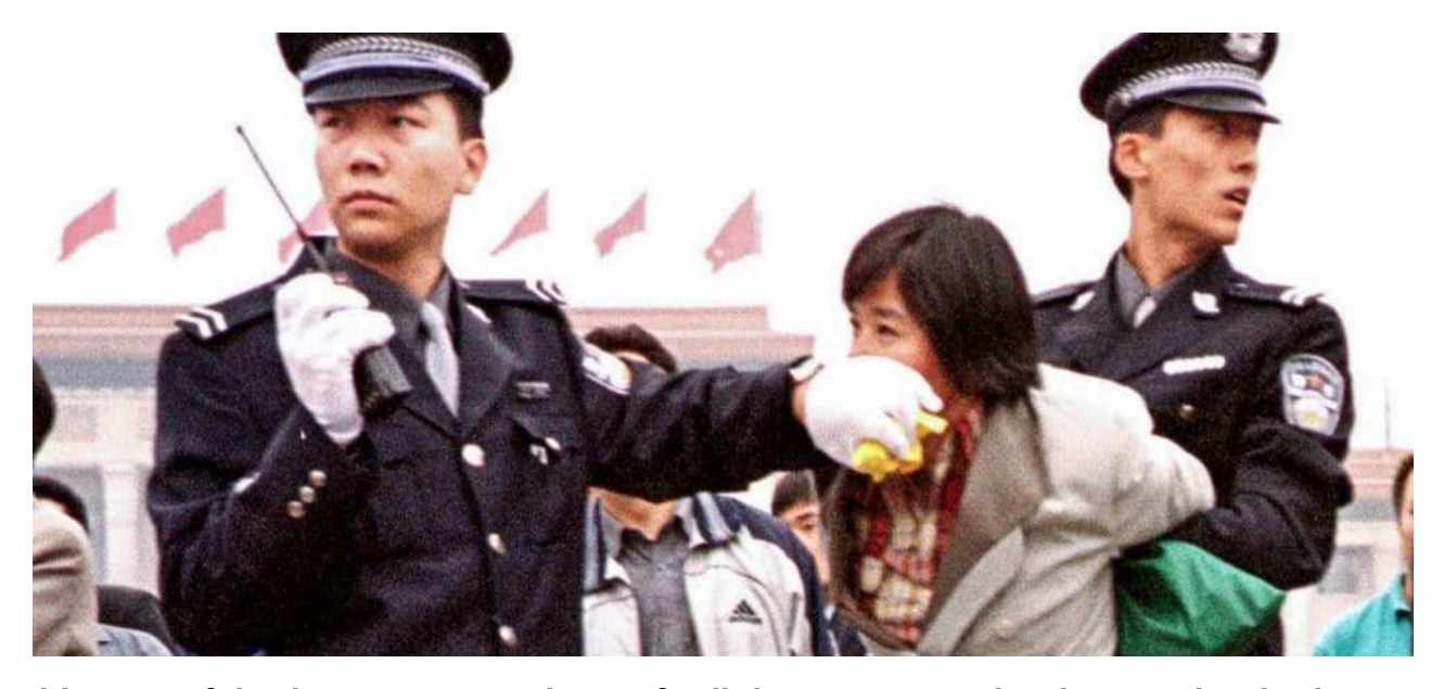
It's one of the largest campaigns of religious persecution happening in the world over the past 20 years.

Millions of innocent people in China have been fired from their jobs, expelled from school, jailed, tortured, or killed simply for practicing Falun Gong (see Key Statistics for more details).