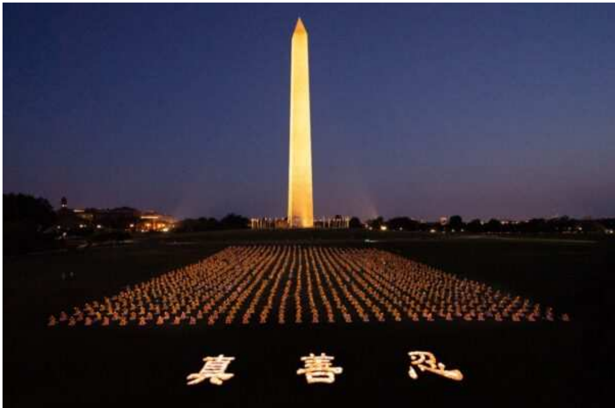
Falun Gong practitioners at candlelight vigil remembering victims of the 22 years of persecution in China at the Washington Monument on July 16, 2021. The characters for “Truthfulness, Compassion, Tolerance,” the principles taught by the spiritual practice appear at the front.

“One neighbor who used to be friendly swore at me and my family. Even children sometimes cursed at us because they too had been influenced by the propaganda,” he told Minghui, while recounting the persecution he suffered.