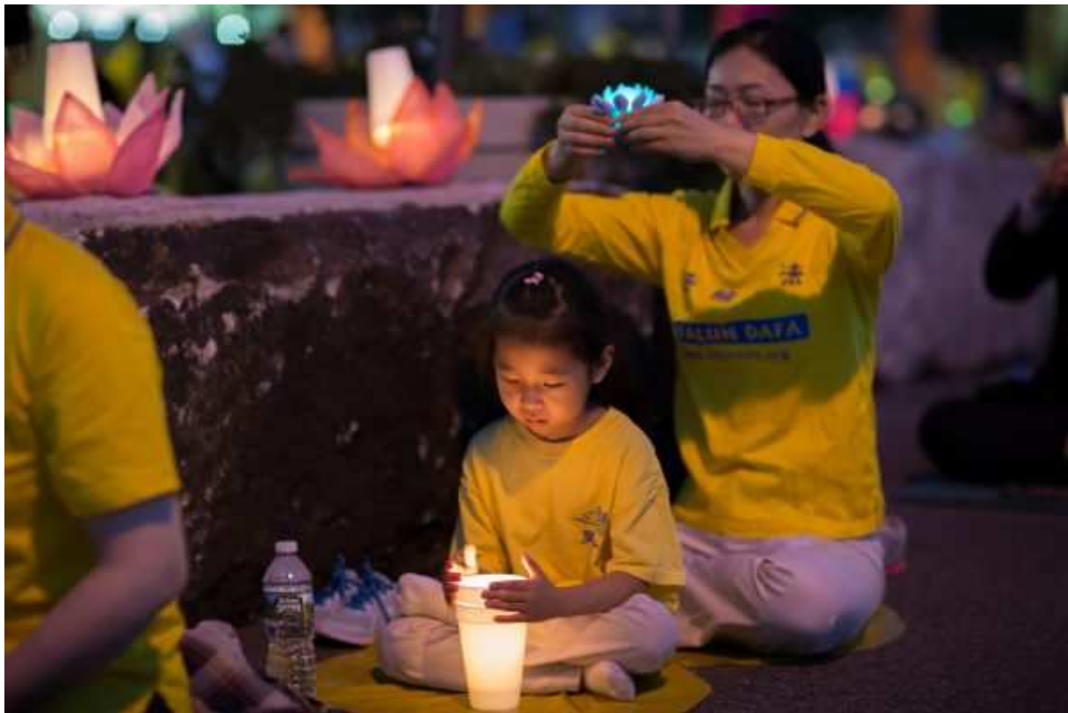
A mother and daughter join Falun Gong practitioners for a candlelight vigil in front of the Chinese Consulate in New York on July 16, 2017. Launched on July 20, 1999, the persecution is now entering its 18th year inside China.